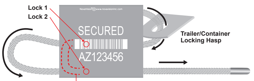
Cable Loop position when cable is fully tightened

4. Reinsert the free end of the cable into the lock until it exits the lock body; pull cable tight to remove all slack from the second loop.