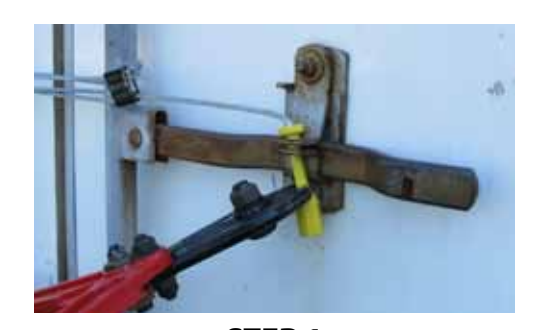
• Use Bolt Cutters to remove Bolt Seal. Use caution as bolt may come off at high speed.