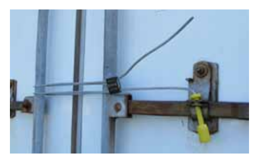
• Thread Cable into Cable Lock, pull taught to remove any slack.