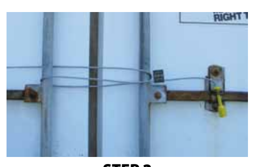
• Weave Cable through locking bars. Create a figure-eight for additional security.